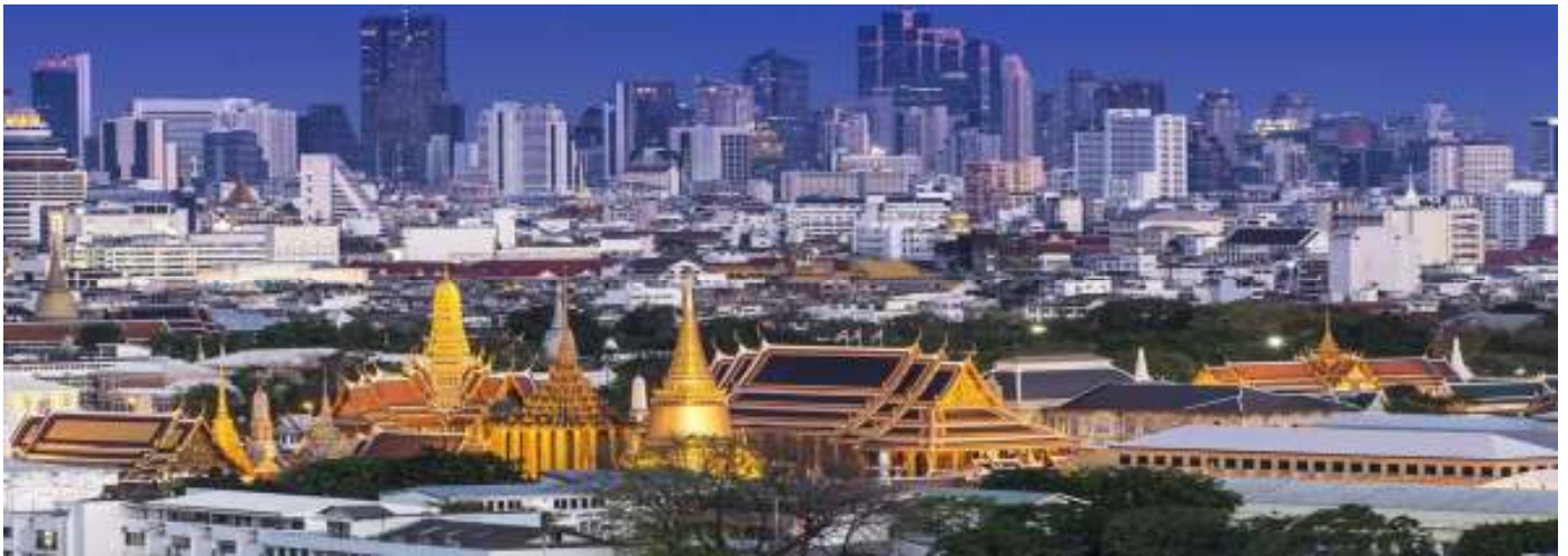
The Grand Palace in the heart of the bustling city of Bangkok

When I visited Thailand in 2015 I took a whole series of photographs of the Grand Palace in Bangkok and filed them thinking that one day I would create a piece based round some of the figures which decorated the Palace.