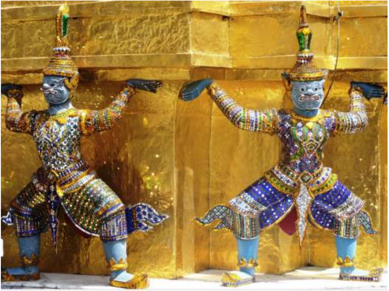
The Guardians of Wat Phra Kaew Temple, Bangkok, Thailand

The Palace's incredible architecture and intricate design continues to inspire, a testament to the brilliance and creativity of the Thai craftsmen who built it. Whilst it no longer serves any governmental role, the palace complex still hosts many official and religious ceremonies.