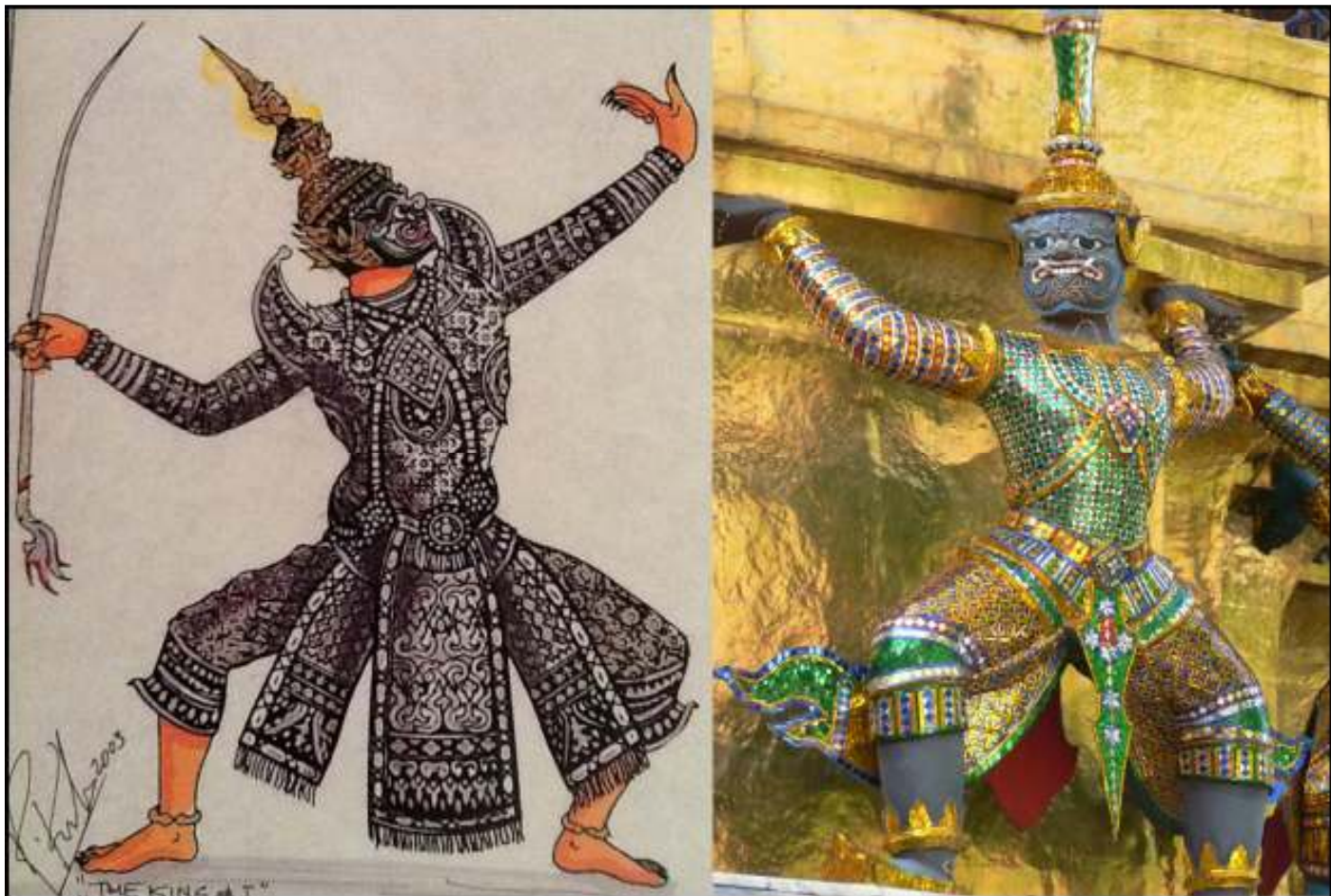
Contrast the costume of Simon of Legree with the Statue Guard of the Emerald Buddha

I had thought about the design for several years and found a piece of heavy white material which was ideal for the project. I collected together a selection of different colour threads, beads and embellishments, metallic braids and threads then drew the design onto the material with a water-soluble pen and started stitching. I knew that the stitching would have to be very heavy and ornate if it was to represent the ornate figures which are so prevalent in the Palace.