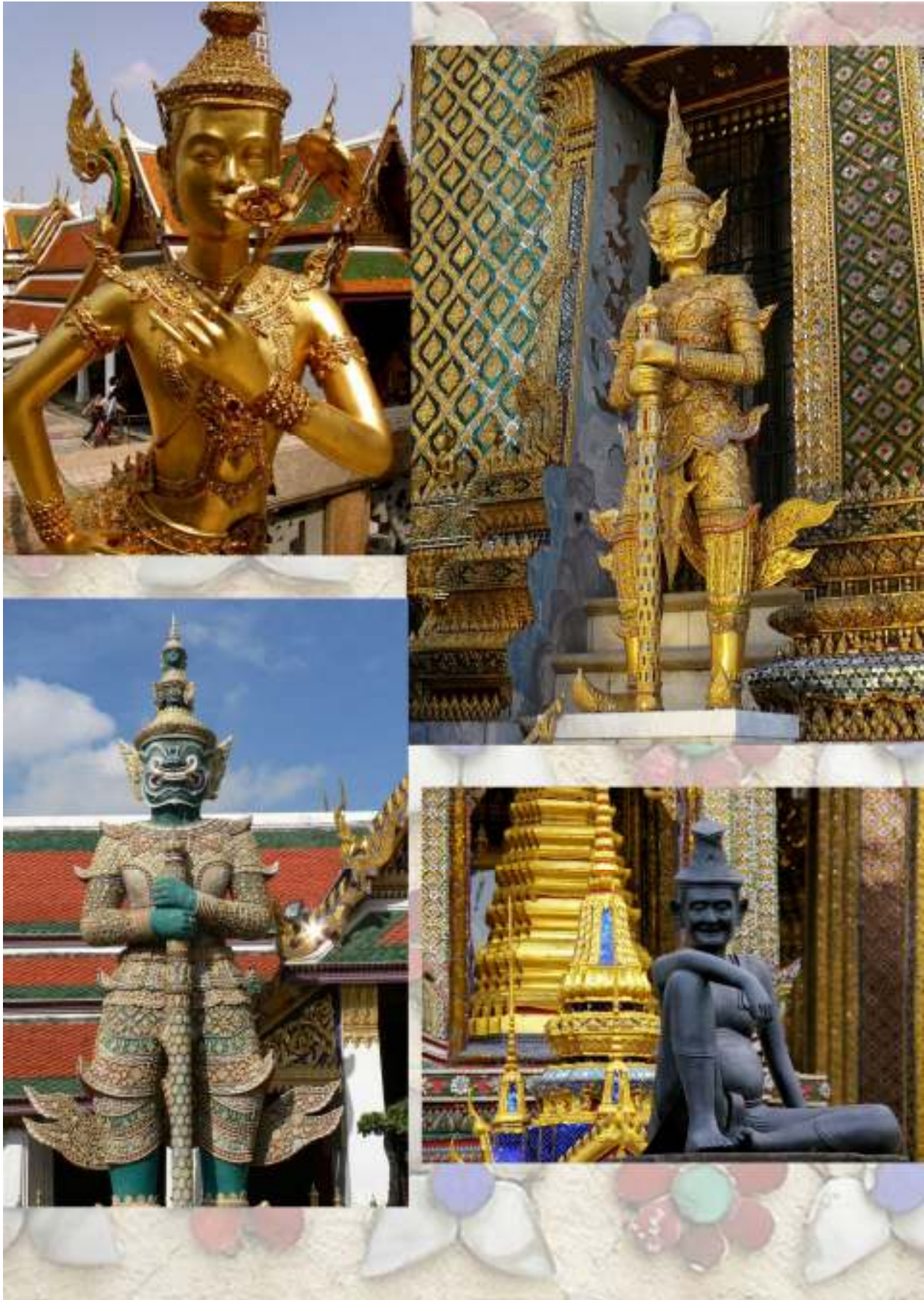
Guardians of the Palace

The Grand Palace is a massive complex that also houses the Temple of the Emerald Buddha (Wat Phra Kaew) perhaps the kingdom's most important temple. It houses an image of Buddha sculpted from a single block of Jade. So revered is this Buddha that only the King himself is permitted to change the robes of the Emerald Buddha, at least three times a year.