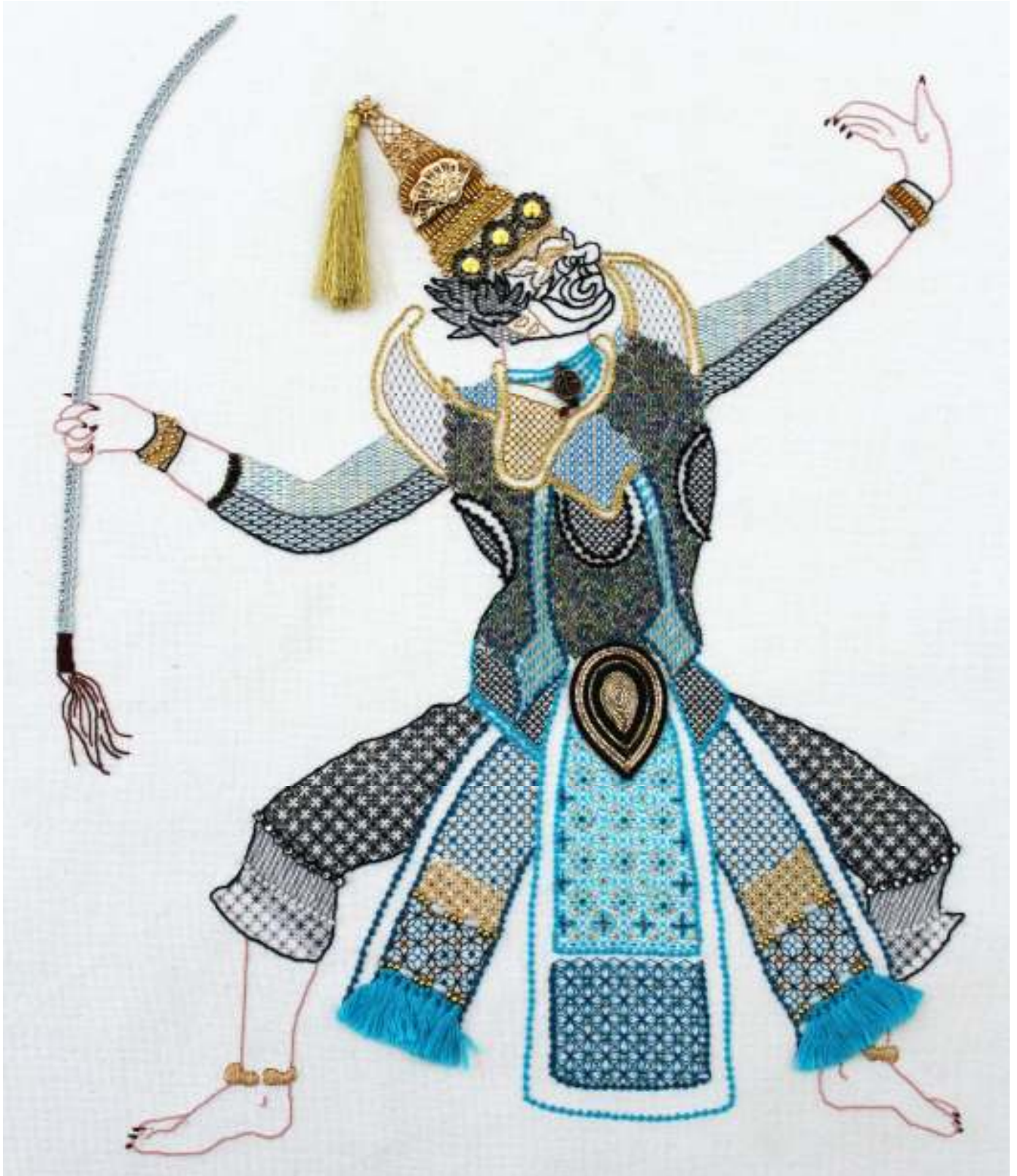
Thai Guardian complete!

I washed the water-soluble blue pen drawing away in cold water, placed it face down on a soft towel and pressed lightly.