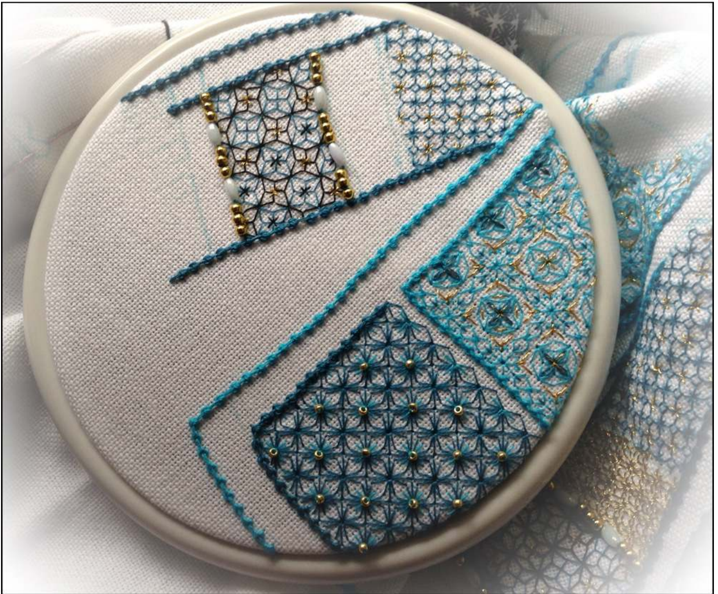
Adding texture to the outlines using double knot stitch created areas to fill

Blackwork filler patterns fall into three groups - light, medium and dark. Look carefully at the pattern to decide where these different areas would be. Do not put two heavy patterns together as it unbalances the design.