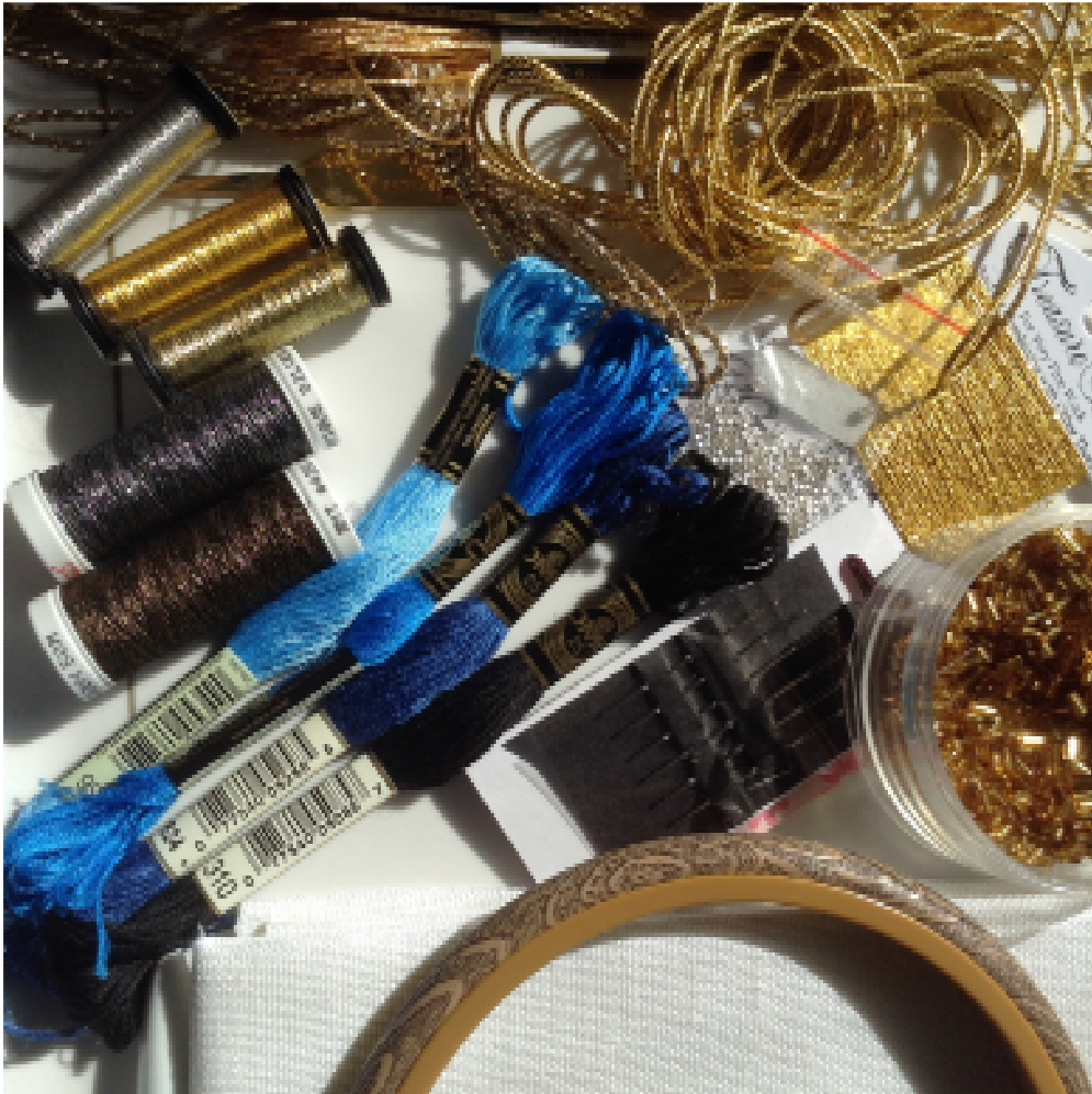
Some of the threads and equipment used in Thai Guardian